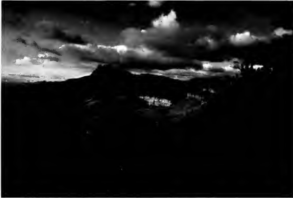
Castle Reef, Rocky Mountain Front: Tim Egan